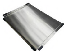
Arraso Draining Tray ARRDT