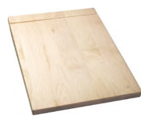
Arraso Chopping Board ARRCB